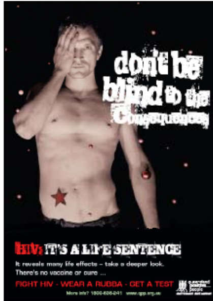
CONSEQUENCES POSTER Available in A4,A3,A2