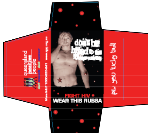
CONSEQUENCES CONDOM Comes with condom & lube