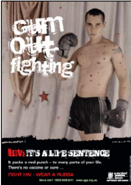
FIGHTING POSTER Available in A4,A3,A2