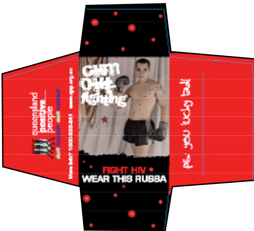
FIGHTING CONDOM Comes with condom & lube