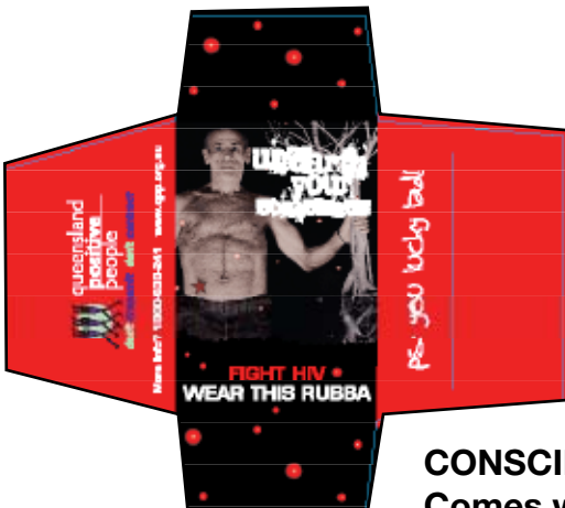
CONSCIENCE CONDOM Comes with condom & lube